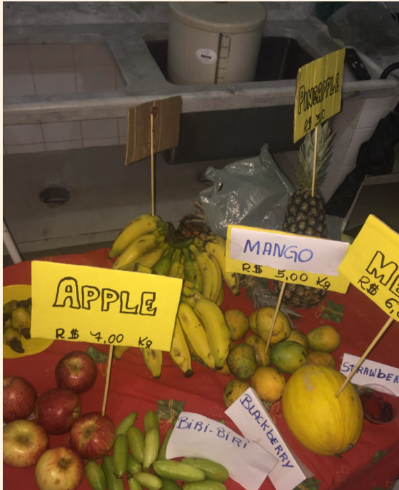
FIGURE 1 ENGLISH ORAL COMMUNICATION - THEMATIC PRESENTATION - GROCERY STORE

For the English Oral Communication course, I suggested thematic presentations in English in order to promote the use of multilingualism and a dialogue between English and local realities. I refer to multilingualism (although it can have different meanings) as something to be encouraged because in Porto Seguro, Coroa Vermelha and Cabrália, 7 Portuguese is not the only language spoken. For example, Patxohã, a language of the Pataxó people is used to maintain their cultural heritage over the years. To carry out the activities, I previously divided the class into groups with different themes: Jobs, Science, Internet, and Grocery Store. I chose to work with different themes while asking students to highlight local issues during their presentations. Thus, one of the groups carried out a thematic presentation about Grocery Store by recreating a street market (which is more common in Brazil's low income areas than grocery stores) in the classroom with local and non-local fruits, and playing the roles of street market vendors by communicating their jobs and services in English.