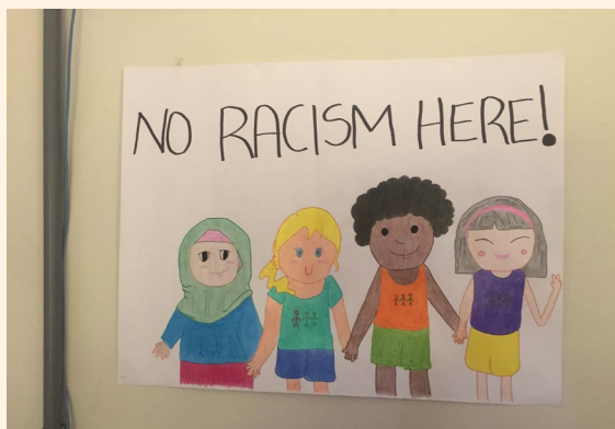
FIGURE 2 ENGLISH TEXT COMPREHENSION - GROUP PRESENTATION (“WHAT IS RACISM?”/ DEMONSTRATION)

By doing this, they were able to lead their learning process through a creative lens. I chose this strategy based on their own opinions. In addition, they were required to produce a glossary about each text divided in two word groups: general (with basic words students would find in the texts) and specific (with specific concepts, by talking about them and their racial experiences). As for rewriting the texts into different text genres, I followed the arguments of Dolz and Schneuwly (2011) about the use of oral text genres. In this respect, group 1 used the sentence “What is racism?” to turn the text into a demonstration (with handmade posters, a video where they roleplayed situations of racism in English, etc.).