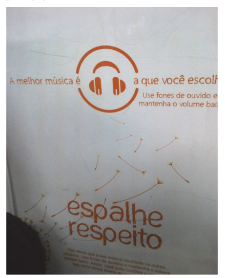
FIGURE 2 SP-METRO CAMPAIGN 2013

The writing says: "The best music is the one you choose. Use earphones and keep the volume down. Spread respect."