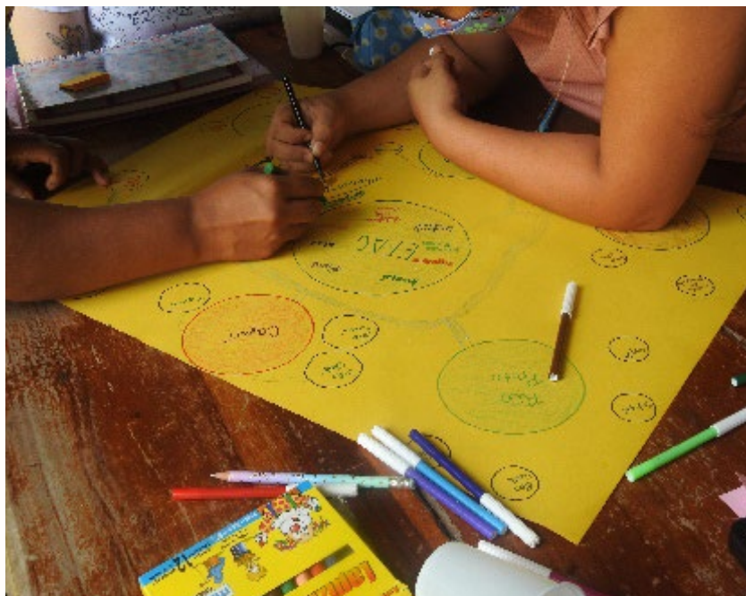
Figure 3 Pedagogical maps at EFAC's training centers